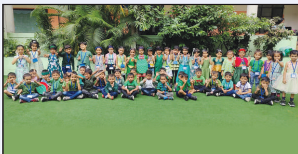
Green Colour Day