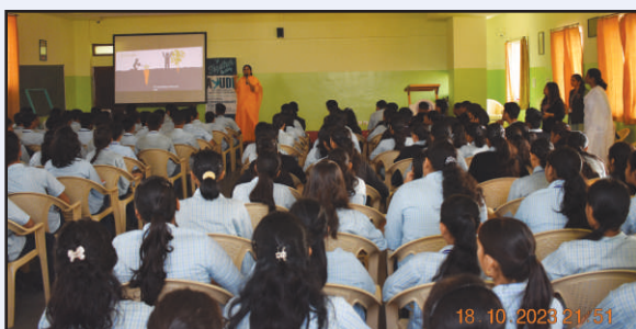
Cyber Crime Awareness in School Auditorium